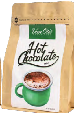
Mint 0129 | 16oz