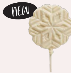
Snowflake w/ Glitter Pop

Milk, Dark or White Chocolate 9026 | 1.5oz