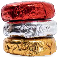
Van Oreos Single Foiled 0256 | 0.8oz