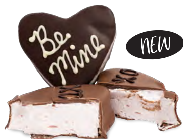
Vanilla Marshmallow Conversation Heart

When it's Valentine's Day, your customers will love these sweet treats to share!