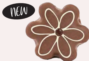
Jumbo Decorated Marshmallow