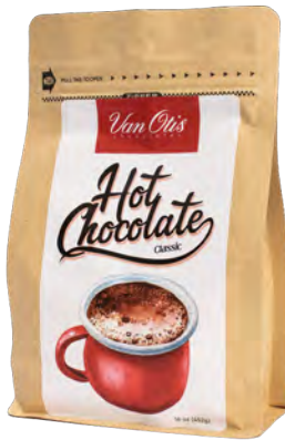
Classic 0128 | 16oz