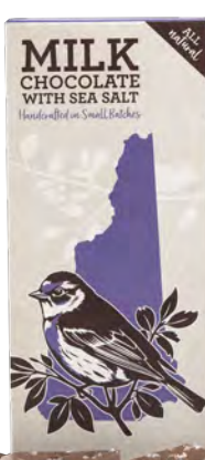
Milk with Sea Salt NH Souvenir Bar NH006 | 2.5oz