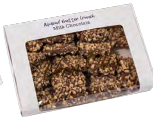
Almond Butter Crunch Milk Chocolate Covered Toffee Rolled in Almonds 5002B | 8oz