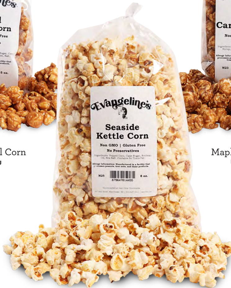
Seaside Kettle Corn POP03 | 8oz bag 36 bags/case