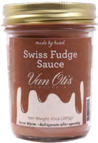
Swiss Fudge Sauce 0193 | 10oz