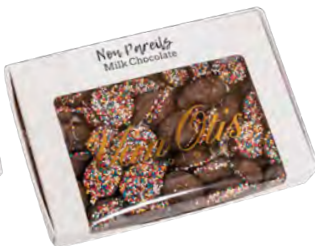
Non Pareils Milk Chocolate 5002G | 8oz