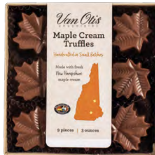
Maple Cream Truffles Milk Chocolate maple01 | 3oz