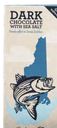
Dark with Sea Salt NH Souvenir Bar NH003 | 2.5oz