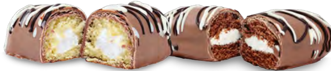
Temptation Twinkie Milk Chocolate 3602 | 2.5oz