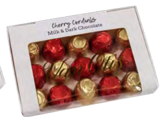
Cherry Cordials Milk & Dark Chocolate 5002F | 8oz