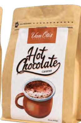
Caramel 0131 | 16oz