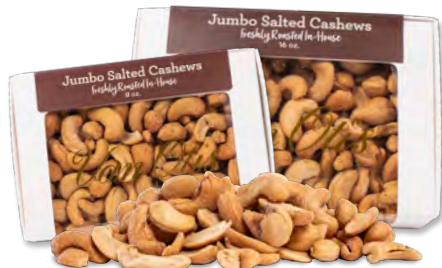
Jumbo Salted Cashews Large Box 5601A | 16oz Medium Box 5601B | 8oz Small Bag 5601C | 4oz