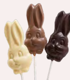
Small Bunny Head Pop