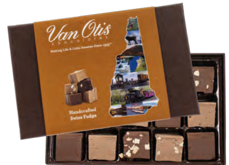
NH Souvenir Swiss Fudge Milk & Dark Chocolate with & without Nuts 2016A | 8.5oz