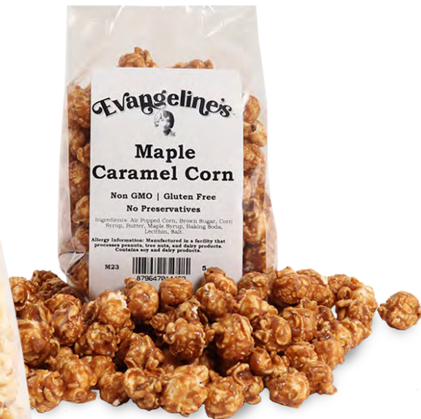
Maple Caramel Corn POP02 | 5oz bag 72 bags/case