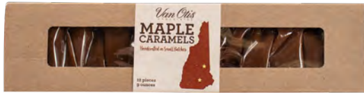
12 Piece Box Wrapped Maple Caramels 5002M | 9oz