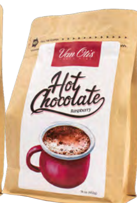
Raspberry 0130 | 16oz