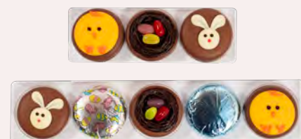
Easter Decorated Van Oreos