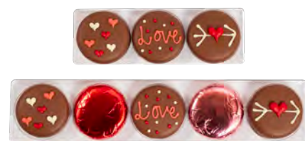
Valentines' Decorated Van Oreos