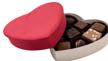
Small Heart Box