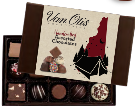
NH Souvenir Assorted Box Milk & Dark Assorted Chocolates 1002A | 7.5oz