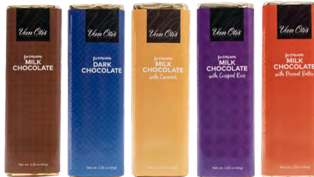
Premium Chocolate Bars