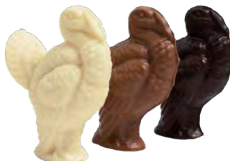
Small Turkey Mold

Milk, Dark or White Chocolate 6654 | 4oz