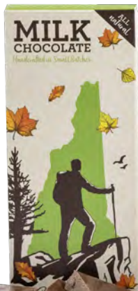
Milk Chocolate NH Souvenir Bar NH001 | 2.5oz