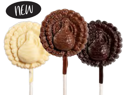
Large Turkey Pop

Milk, Dark or White Chocolate 6651 | 3oz