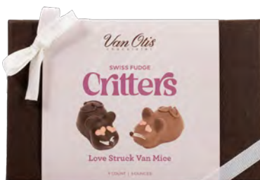
9pc Lovestruck Mice Gift Box