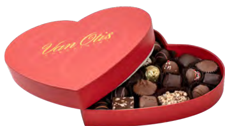
VO Heart Box