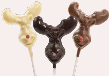
Red Nosed Reindeer Pop

Our Christmas Pops make the perfect stocking stuffer... if your customers can go that long without digging into these tasty treats!