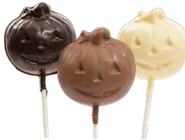
Plump Pumpkin Head Pop

Milk, Dark or White Chocolate 6653 | 2oz