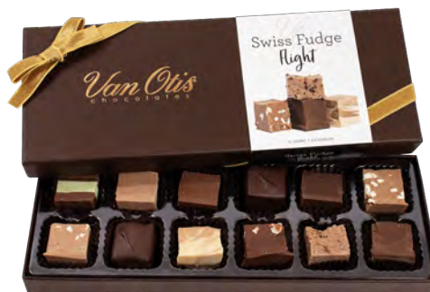
Swiss Fudge Flight