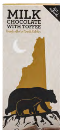
Milk with Toffee NH Souvenir Bar NH004 | 2.5oz