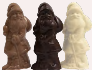
Santa with Cane Mold

Milk, Dark or White Chocolate 6751 | 2.25oz