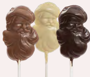
Small Santa Face Pop

Milk, Dark or White Chocolate 6759 | 1.5oz