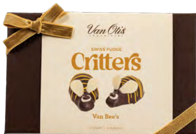
9pc Van Bees Gift Box