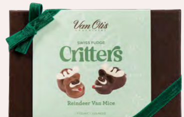
9pc Van Reindeer Gift Box