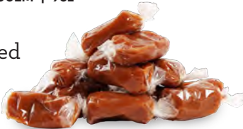
Individually Wrapped Maple Caramels Bulk 0258 | 0.75oz