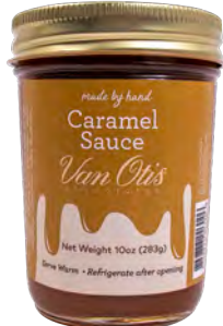
Caramel Sauce 0195 | 10oz