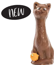
Long Neck Cat

Milk, Dark or White Chocolate 6652 | 2oz