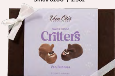
9pc Van Bunny Gift Box