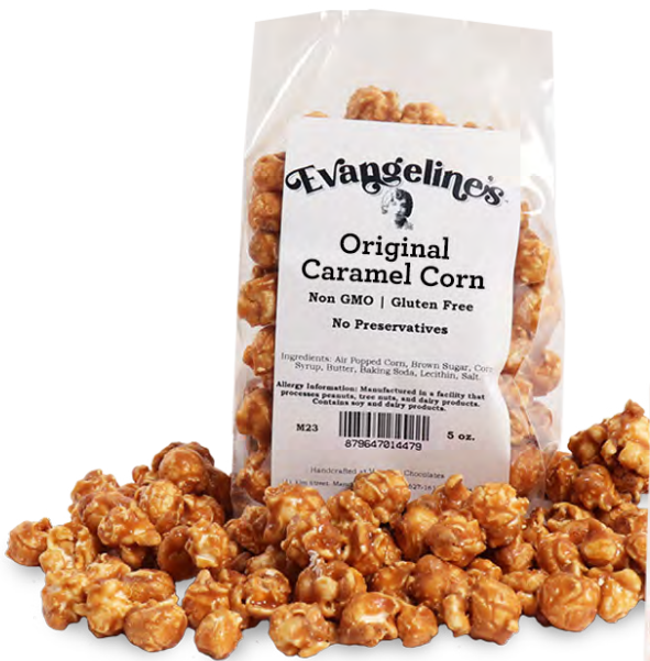
Original Caramel Corn POP01 | 5oz bag 72 bags/case