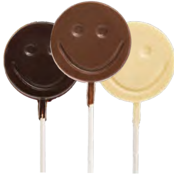
Smiley Face Pop