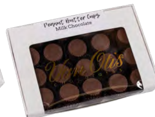
Peanut Butter Cups Milk Chocolate 5002E | 8oz