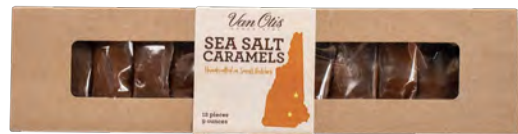
12 Piece Box Wrapped Sea Salt Caramels 5002D | 9oz