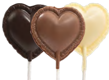
Heart with Ruffles Pop