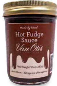
Hot Fudge Sauce 0194 | 10oz