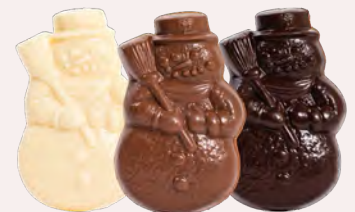
Small Snowman Mold

Milk, Dark or White Chocolate 6772 | 1.5oz