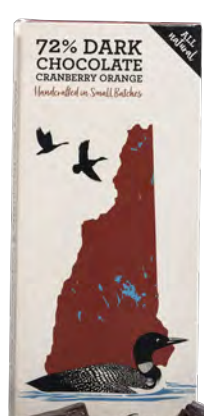
72% Dark with Cranberries & Orange NH Souvenir Bar NH005 | 2.5oz