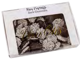
Non Pareils Dark Chocolate 5002A | 8oz