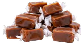
Individually Wrapped Sea Salt Caramels Bulk 0257 | 0.75oz